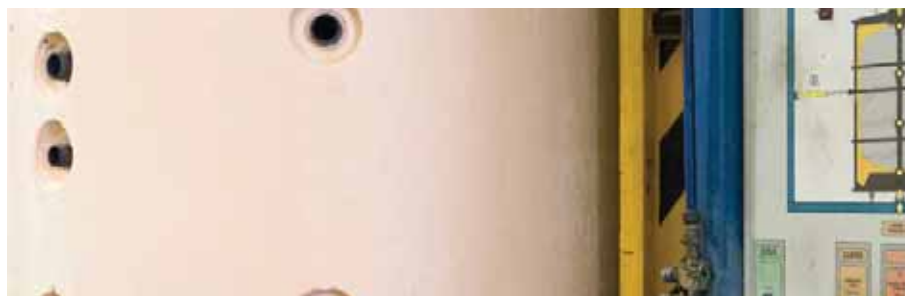
Rigid, mould-injected PU insulating material.

The " GEISER INERTIA AND MASTER INERTIA " series of tanks are thermally insulated at the factory by direct mould-injection with CFC-free and HCFC-free PU material. This system guarantees a perfectly regular insulation thickness with optimum material density. The thicknesses indicated in the table refer to the circular tank body, but the insulation is much thicker on the top part (up to four times greater). Because the top zone of the tank has better thermal protection, heat losses are much lower than those specified by the most stringent regulations, such as the DIN 4753/8 standard.